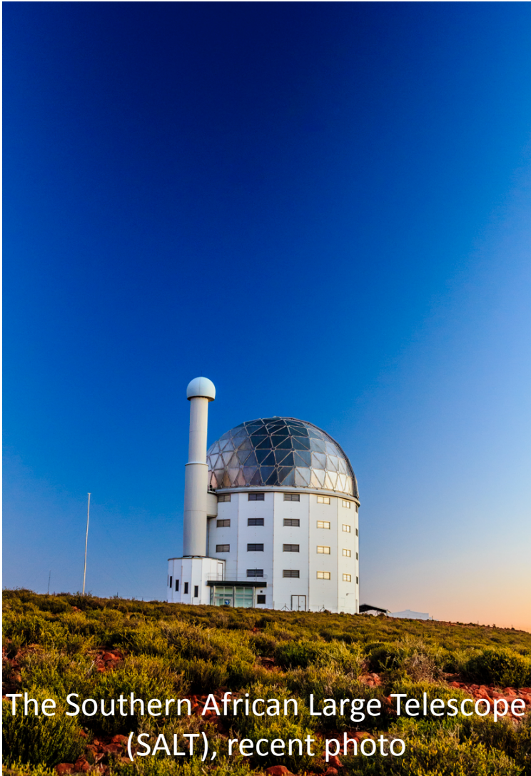
The Southern African Large Telescope (SALT), recent photo