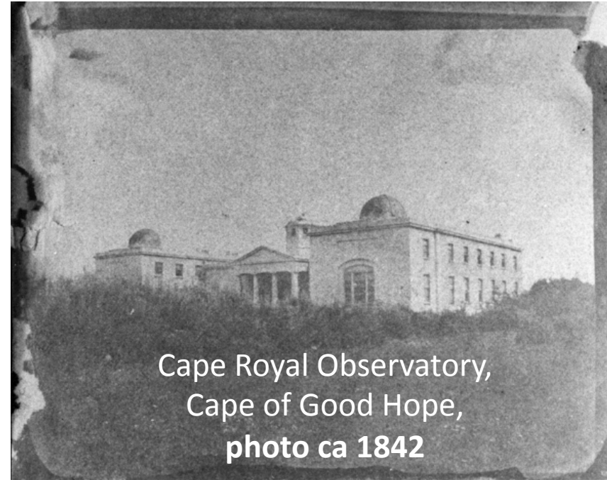
Cape Royal Observatory, Cape of Good Hope, photo ca 1842